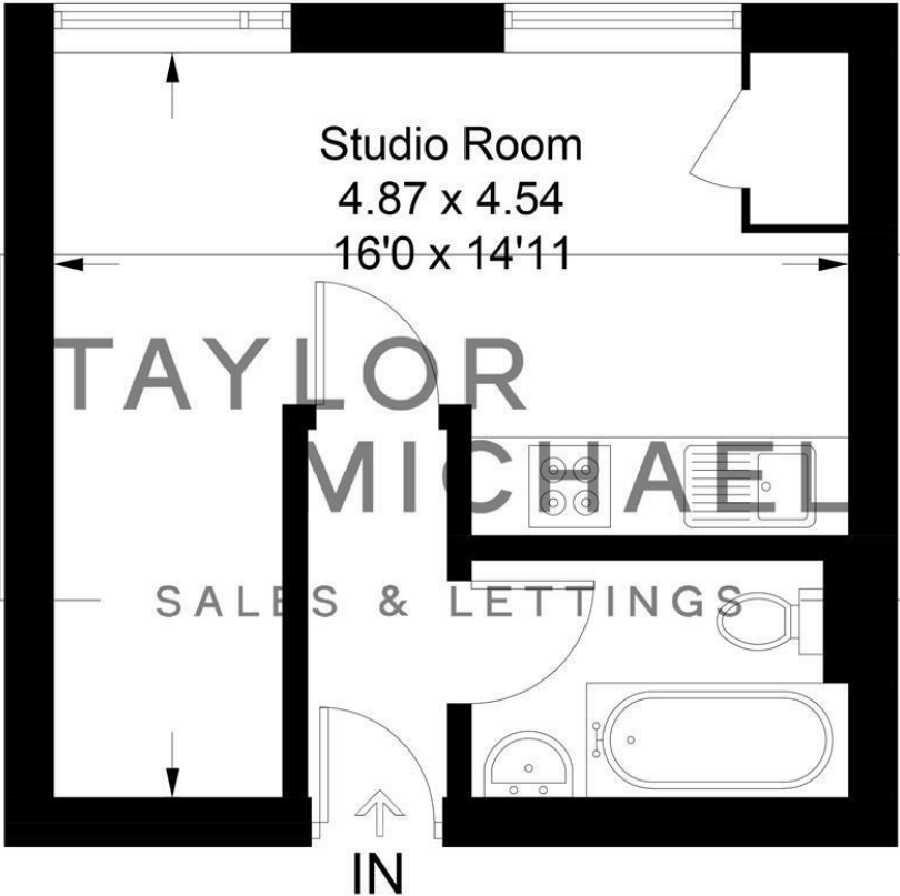
Illustration for identification purposes only, measurements are approximate, not to scale. Imageplansurveys @ 2026